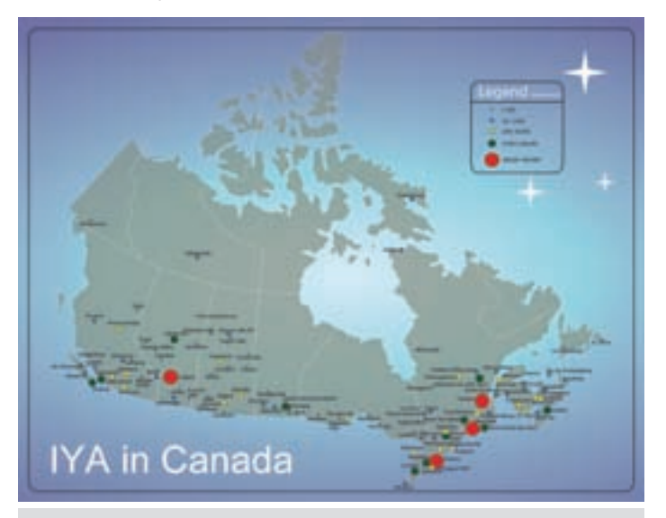
Figure 1 — Galileo Moment geographical distribution across Canada.

Early on, we adopted a simple way of summarizing progress towards our overarching goal of offering an engaging astronomical experience, a "Galileo Moment (GM)" of personal astronomical discovery, to every Canadian, thereby using the wonder of the night sky to inspire an interest in the cosmos and in science in general. The fairly inclusive definition was meant to encourage both traditional (e.g. star parties, visits to planetaria, etc.) and non-traditional (e.g. attending art or musical events with strong astronomy content) approaches to help people reconnect with the cosmos. Event organizers reported the Galileo Moments achieved (that is, attendance), and a simple counter on our bilingual Web site increasingly captured attention as 2009 progressed. Formally, we celebrated passing the one million goal on October 27, but when all the late reports of earlier events came in, we now know it actually occurred much earlier in the year. By the end 1.93 million GMs were recorded throughout Canada.