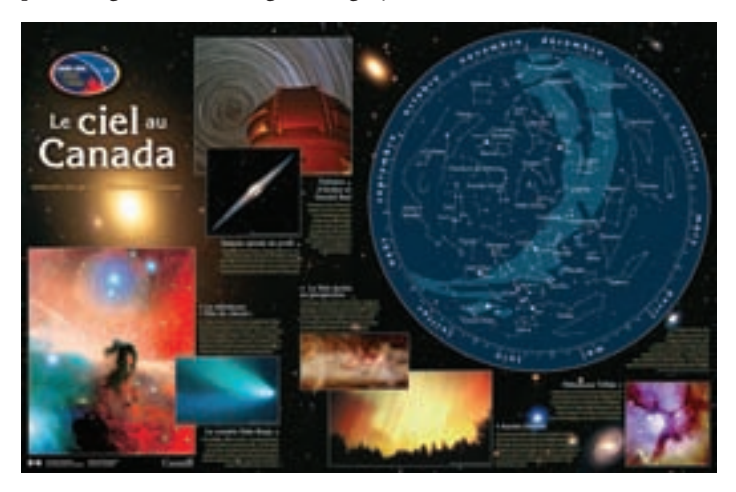
Figure 8 — The French version of an educational poster widely distributed by NRC.

For instance, the National Research Council updated their popular Canadian Skies poster, with its information about Canadian ground-based astronomy, and activities for teachers and students. Throughout Canada, at teachers' conferences, in schools, and at public events, NRC distributed 11,441 posters (twice as many as during 2008), experienced a 30 percent increase in Web hits, and distributed 1100 RASC-FAAQ Star Finders . Emphasizing Canada's contributions to space astronomy missions, and thus nicely complementing the NRC poster, the Canadian Space Agency produced a new educational poster, Secrets of the Night Sky , to commemorate IYA. Since distribution began in June, students, teachers, and the public have received 6300 copies. Together these posters are reaching hundreds of thousands of young Canadians, providing another strong IYA legacy.