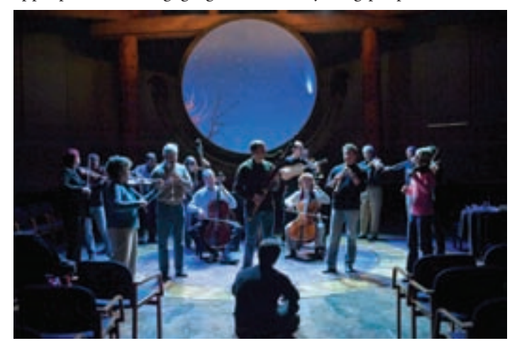
Figure 4 — Tafelmusik Baroque Orchestra performing their Galileo Project concert in Banff.

appropriate and engaging manner for young people.