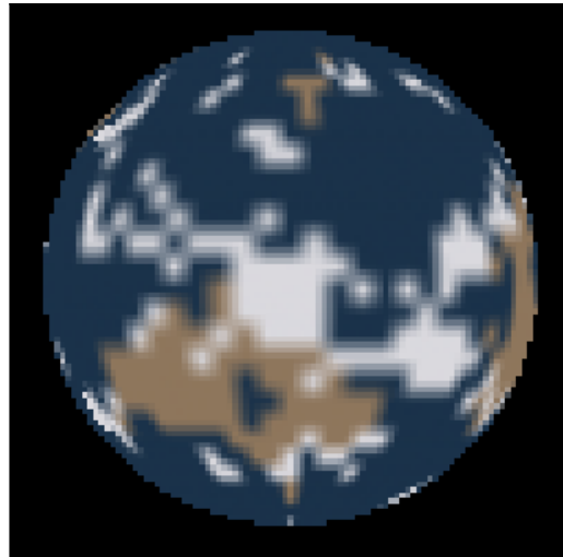
Figure 3: Maps of the surface of the candidate planet taken at two different times. Times are indicated above each image relative to the times shown in the radial velocity curve. Those maps are shown here. Tan areas indicate what we believe to be land, while blue-ish areas indicate what we believe to be liquid regions of some kind. Other colors present reflect the visible color as best as we are able to measure.