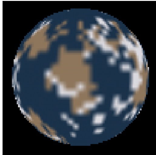
Figure 3: Maps of the surface of the candidate planet taken at two different times. Times are indicated above each image relative to the times shown in the radial velocity curve. Those maps are shown here. Tan areas indicate what we believe to be land, while blue-ish areas indicate what we believe to be liquid regions of some kind. Other colors present reflect the visible color as best as we are able to measure.