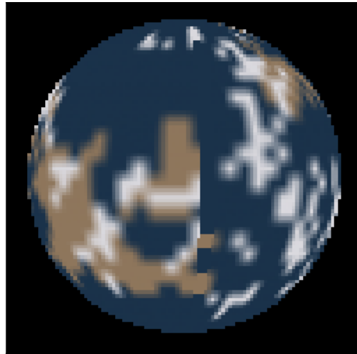
Figure 3: Maps of the surface of the candidate planet taken at two different times. Times are indicated above each image relative to the times shown in the radial velocity curve. Those maps are shown here. Tan areas indicate what we believe to be land, while blue-ish areas indicate what we believe to be liquid regions of some kind. Other colors present reflect the visible color as best as we are able to measure.