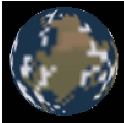
Figure 4: Maps of the surface of the candidate planet taken at two different times. Times are indicated above each image relative to the times shown in the radial velocity curve. Those maps are shown here. Tan areas indicate what we believe to be land, while blue-ish areas indicate what we believe to be liquid regions of some kind. Other colors present reflect the visible color as best as we are able to measure.