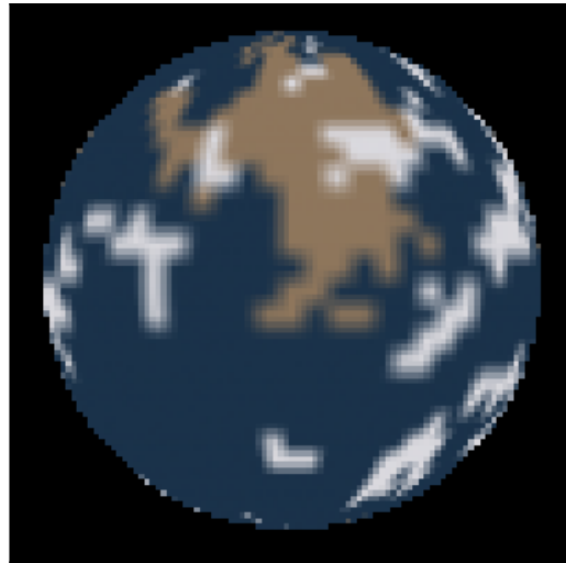
Figure 3: Maps of the surface of the candidate planet taken at two different times. Times are indicated above each image relative to the times shown in the radial velocity curve. Those maps are shown here. Tan areas indicate what we believe to be land, while blue-ish areas indicate what we believe to be liquid regions of some kind. Other colors present reflect the visible color as best as we are able to measure.