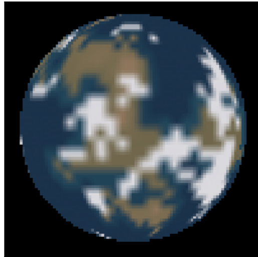
Figure 4: Maps of the surface of the candidate planet taken at two different times. Times are indicated above each image relative to the times shown in the radial velocity curve. Those maps are shown here. Tan areas indicate what we believe to be land, while blue-ish areas indicate what we believe to be liquid regions of some kind. Other colors present reflect the visible color as best as we are able to measure.