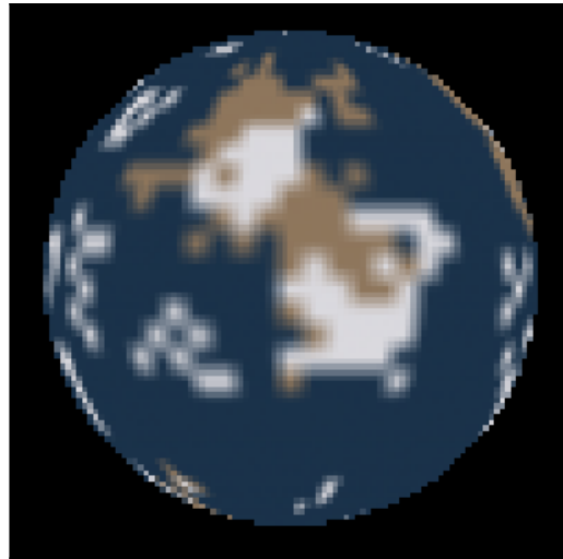
Figure 3: Maps of the surface of the candidate planet taken at two different times. Times are indicated above each image relative to the times shown in the radial velocity curve. Those maps are shown here. Tan areas indicate what we believe to be land, while blue-ish areas indicate what we believe to be liquid regions of some kind. Other colors present reflect the visible color as best as we are able to measure.