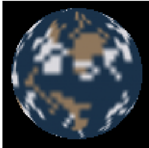
Figure 3: Maps of the surface of the candidate planet taken at two different times. Times are indicated above each image relative to the times shown in the radial velocity curve. Those maps are shown here. Tan areas indicate what we believe to be land, while blue-ish areas indicate what we believe to be liquid regions of some kind. Other colors present reflect the visible color as best as we are able to measure.