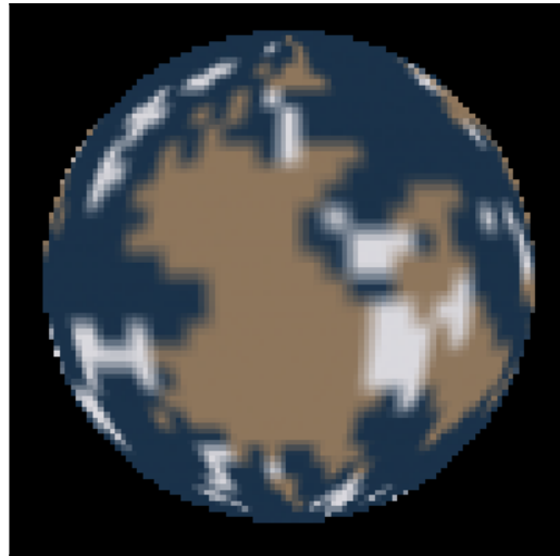
Figure 3: Maps of the surface of the candidate planet taken at two different times. Times are indicated above each image relative to the times shown in the radial velocity curve. Those maps are shown here. Tan areas indicate what we believe to be land, while blue-ish areas indicate what we believe to be liquid regions of some kind. Other colors present reflect the visible color as best as we are able to measure.