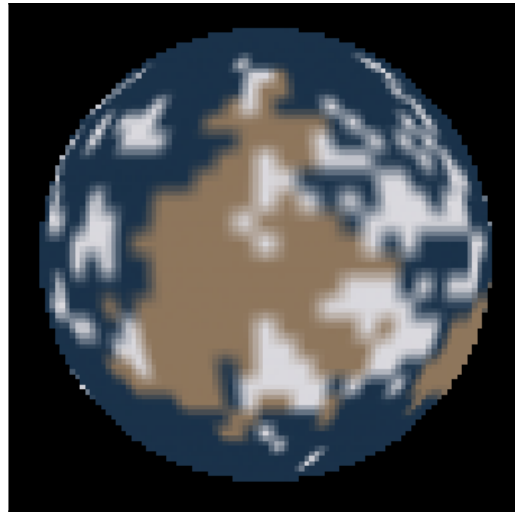
Figure 3: Maps of the surface of the candidate planet taken at two different times. Times are indicated above each image relative to the times shown in the radial velocity curve. Those maps are shown here. Tan areas indicate what we believe to be land, while blue-ish areas indicate what we believe to be liquid regions of some kind. Other colors present reflect the visible color as best as we are able to measure.