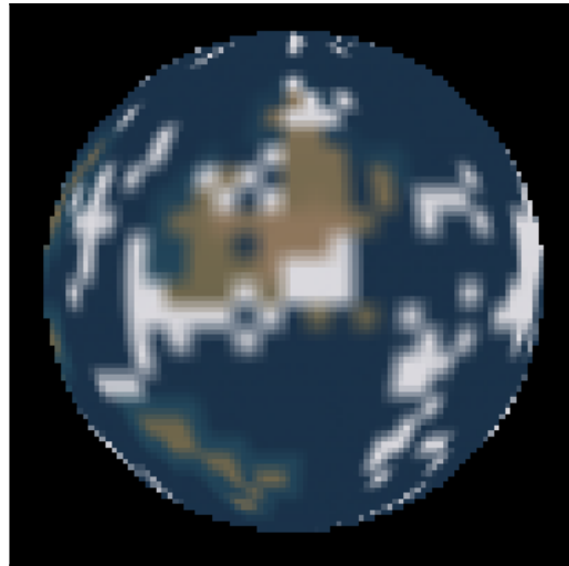
Figure 4: Maps of the surface of the candidate planet taken at two different times. Times are indicated above each image relative to the times shown in the radial velocity curve. Those maps are shown here. Tan areas indicate what we believe to be land, while blue-ish areas indicate what we believe to be liquid regions of some kind. Other colors present reflect the visible color as best as we are able to measure.