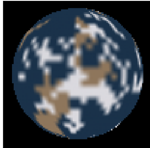
Figure 3: Maps of the surface of the candidate planet taken at two different times. Times are indicated above each image relative to the times shown in the radial velocity curve. Those maps are shown here. Tan areas indicate what we believe to be land, while blue-ish areas indicate what we believe to be liquid regions of some kind. Other colors present reflect the visible color as best as we are able to measure.