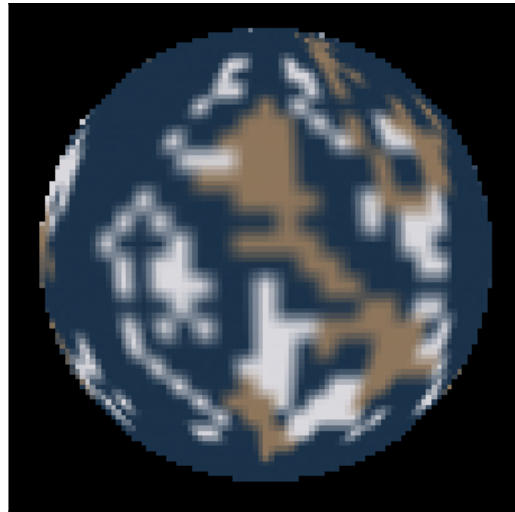
Figure 3: Maps of the surface of the candidate planet taken at two different times. Times are indicated above each image relative to the times shown in the radial velocity curve. Those maps are shown here. Tan areas indicate what we believe to be land, while blue-ish areas indicate what we believe to be liquid regions of some kind. Other colors present reflect the visible color as best as we are able to measure.