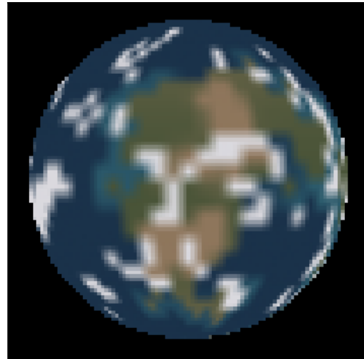
Figure 4: Maps of the surface of the candidate planet taken at two different times. Times are indicated above each image relative to the times shown in the radial velocity curve. Those maps are shown here. Tan areas indicate what we believe to be land, while blue-ish areas indicate what we believe to be liquid regions of some kind. Other colors present reflect the visible color as best as we are able to measure.