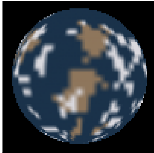
Figure 3: Maps of the surface of the candidate planet taken at two different times. Times are indicated above each image relative to the times shown in the radial velocity curve. Those maps are shown here. Tan areas indicate what we believe to be land, while blue-ish areas indicate what we believe to be liquid regions of some kind. Other colors present reflect the visible color as best as we are able to measure.