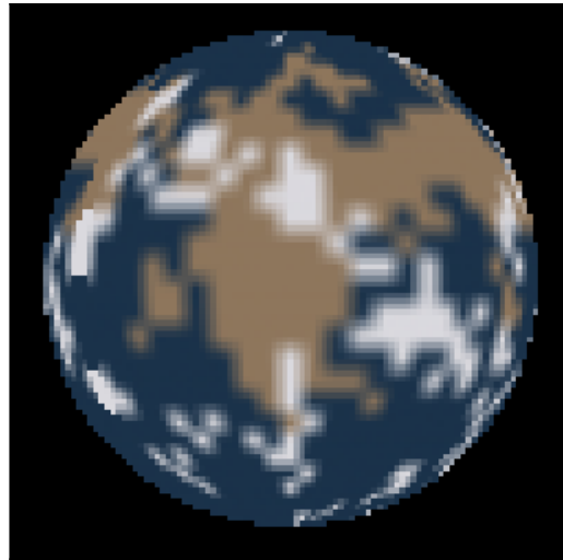
Figure 3: Maps of the surface of the candidate planet taken at two different times. Times are indicated above each image relative to the times shown in the radial velocity curve. Those maps are shown here. Tan areas indicate what we believe to be land, while blue-ish areas indicate what we believe to be liquid regions of some kind. Other colors present reflect the visible color as best as we are able to measure.