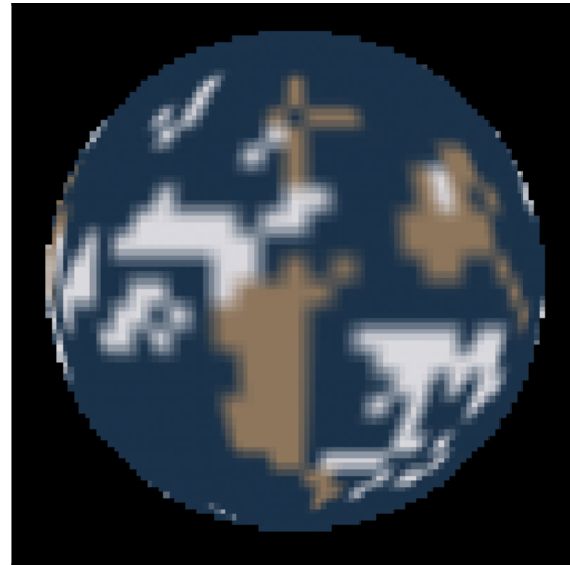
Figure 3: Maps of the surface of the candidate planet taken at two different times. Times are indicated above each image relative to the times shown in the radial velocity curve. Those maps are shown here. Tan areas indicate what we believe to be land, while blue-ish areas indicate what we believe to be liquid regions of some kind. Other colors present reflect the visible color as best as we are able to measure.